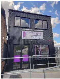
RESOURCE CENTRE 01293 447702

www.crawleyopenhouse.co.uk Charity No.: 1048919